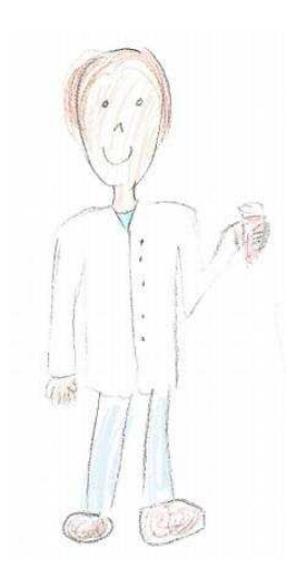
Figure 3: Smith's depictions of a scientist.

Smith's depiction of a scientist was gender neutral and when asked why she made her illustration that way she responded "Because like a scientist can be gender neutral like there doesn't have to be like stereotypically for guys or girls." Smith's illustration is found in Figure 3.