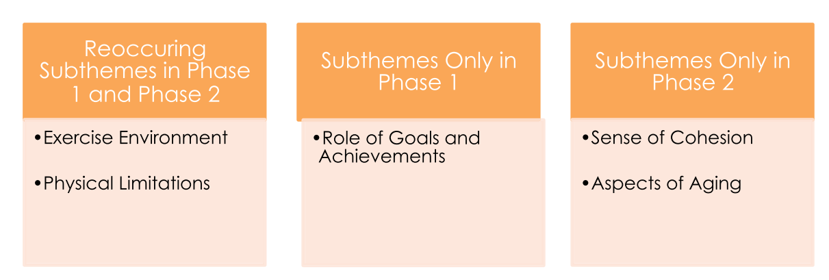
Figure 9: Subtheme similarities/differences among phases.

In pursuit of exploring basic psychological need fulfillment for participants following participation in a structured group-based program and how it may impact long-term exercise adherence, a closer look at competence is needed. According to Teixeira et al. (2012) "experiences of competence vary upon success or failure at challenging physical tasks or as a function of feedback from, for example, a fitness professional" (p. 3). Subthemes contributing to the need competence can be seen in Figure 9. Subthemes have been categorized in different groups; reoccurring subthemes in both Phase One and Phase Two, subthemes that only appeared in Phase One, and subthemes that only appeared in Phase Two.