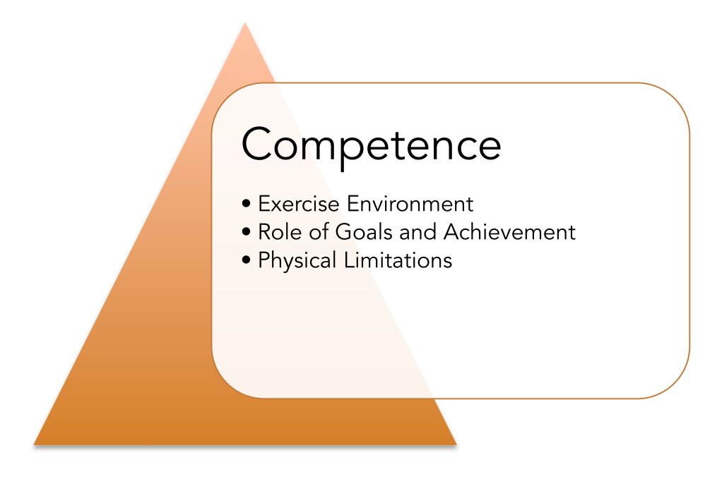
Figure 3: Subthemes within Competence (Phase 1).

and indicating what contributed towards their exercise participation. A summary of subthemes that emerged for Phase One can be seen below in Figure 2.