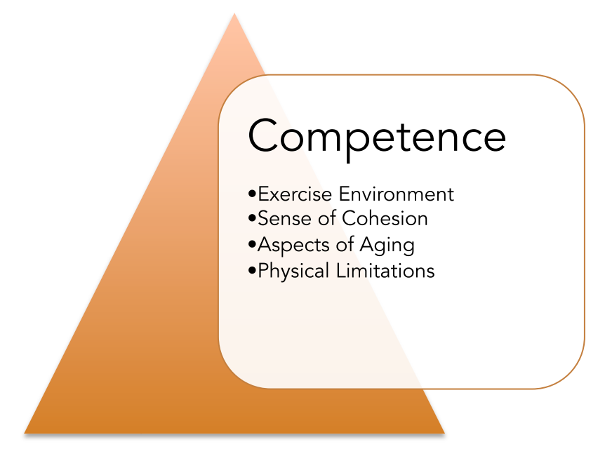
Figure 6: Subthemes within Competence (Phase 2).

comments indicating barriers and facilitators towards their exercise participation. A summary of subthemes that emerged for competence is indicated in Figure 6.