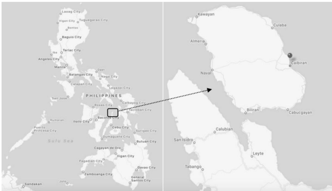
Figure 1. Location of the restoration project in Philippines

Restoration project is part of the research activities of the project ASEM 2010 / 050 improving watered rehabilitation outcomes in the Philippines through systems approach. The restoration project started in the second quarter of 2014. The site is Cambrian, a 26-hectare highland of Caibiran, Biliran Province. Figure 1 shows the location of the restoration project in Philippines. (Gregorios2020)