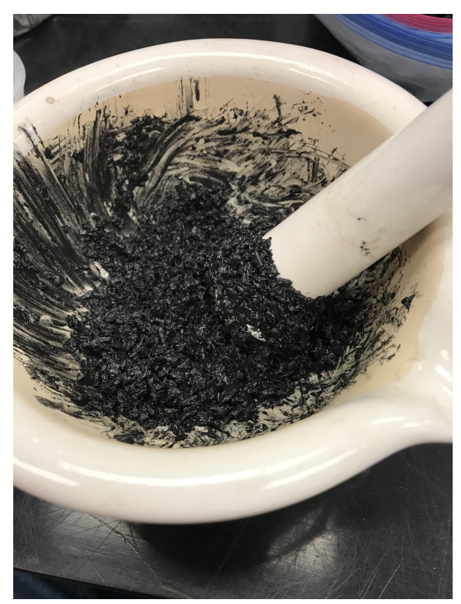
Figure 3. The biochar after being ground with the mortar and pestle.

One kilogram of the waste biochar was provided. The biochar was ground using a mortar and pestle prior to all tests (Figure 3). Half of the ground biochar was dried in a kiln while the other half was stored as is in plastic containers.