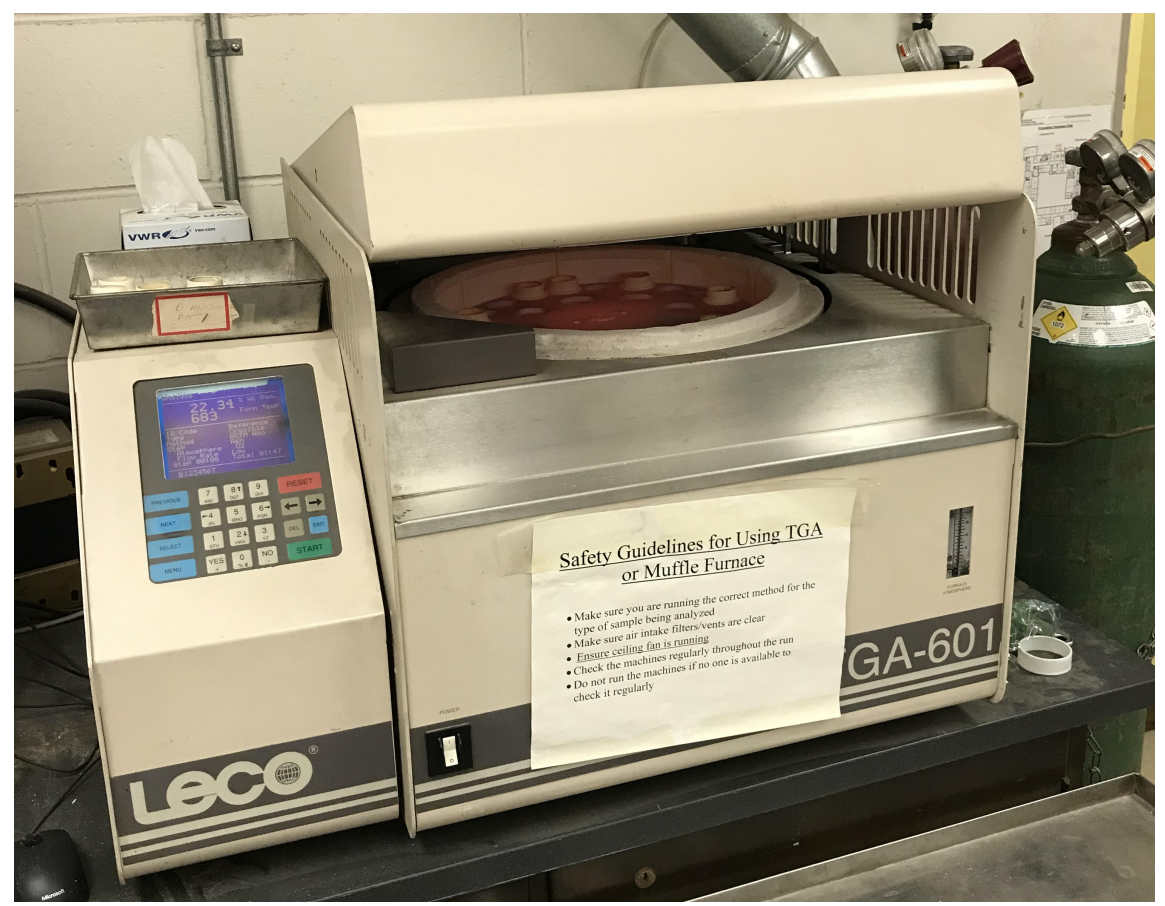
Figure 4. The Leco TGA-601 Thermogravimetric Analyzer conducting a proximate analysis.

The proximate analysis was conducted by the Lakehead University Wood Science Testing Facility using a Loss-On-Ignition (LOI) method to determine the ash, moisture, volatile matter (VM), and fixed carbon (FC) contents of the biochar. A Leco TGA-601 Thermogravimetric Analyzer (TGA) was used (Figure 4).