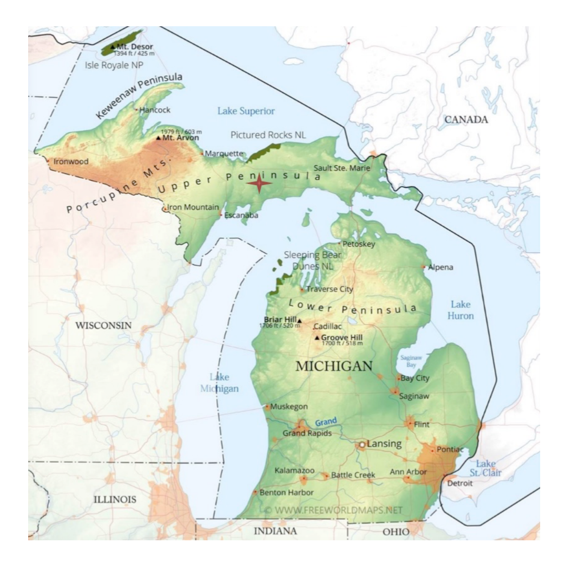
Figure 1: The position of the site study in Michigan.

Looking into the soil type which is mixed, there is Histic endoaquod, frigid, and sand, which form the Kinross soil (Ruth, 2018). The drainage of the soil is very poor, which allows the wetland vegetation to thrive. The soil goes down to up most 12.5 meters, and the top part is composed mostly of decomposed material. The amount of clay is negligible with equal acidity all through (Table 3). The water table does not go so deep, making the area wet most time of the year.