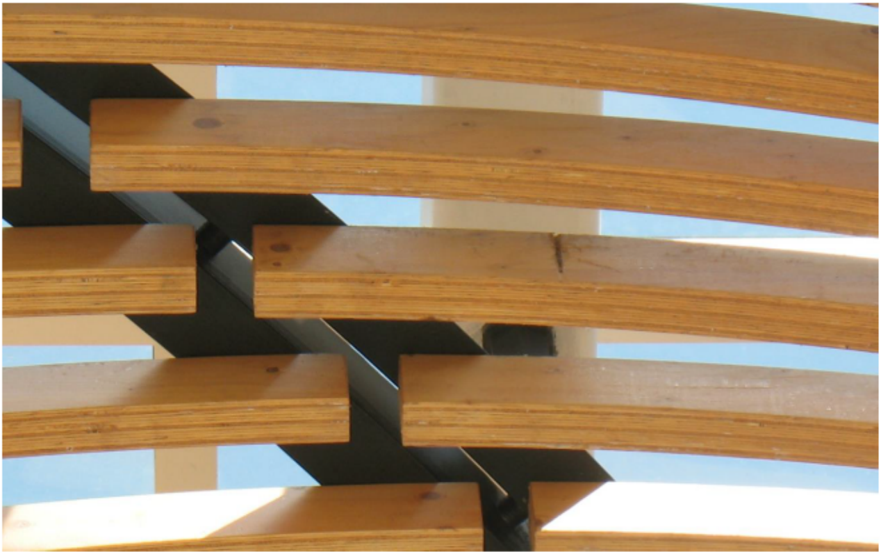
Figure 6. LVL roof trusses (StructureCraft n.d.).

2019). LVL is typically used for permanent structural applications including beams, roof trusses, framing, and portal frames; they are noted to be an ecologically sound choice. LVL trusses also use smaller dimension timbers over a longer distance, thus reducing total timber volume required in the roof trusses. Similar to other EWPs, prefabrication and the light weight of LVL materials allows for cost efficient and fast construction (Forest and Wood Products Australia Ltd. 2019).