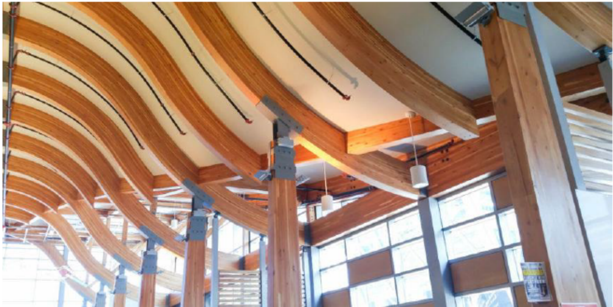
Figure 5. Curved glulam roof beams (Woodpecker Timber Framing 2017).

Glulam consists of multiple individual layers of dimensional lumber, which are glued together. All Canadian produced glulam is made using waterproof adhesives for the end joints and face bonding to suffice as exterior and interior wood (Canadian Wood Council 2019a). Glulam products are typically used in post and beam construction in heavy and mass timber structures and wood bridges. These wood products are typically used as headers, beams, girders, purlins, columns, heavy trusses, or curved members. The glulam products are often left exposed to contribute to the aesthetics of the building (Canadian Wood Council 2019a).