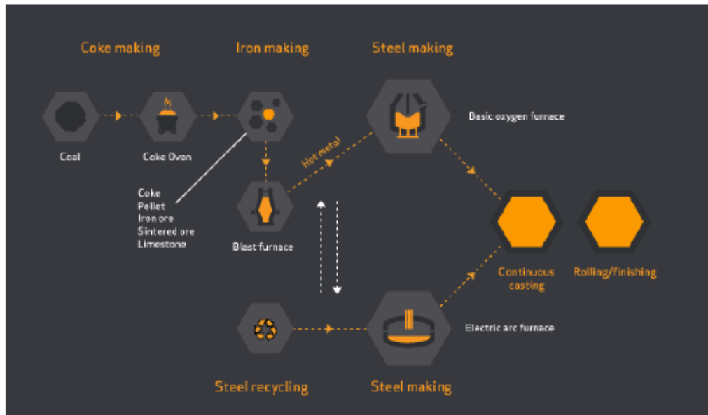
Figure 3. A summary of the steel-making process (World Coal Association 2018).