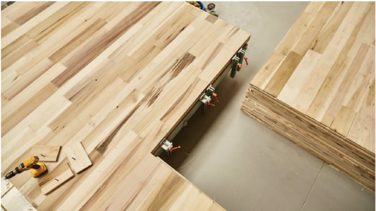
Figure 4. CLT panels clamped after being laminated (AHEC 2018).

CLT is a multi-layer mass timber product, with the layers spanning two directions. Some CLT such as CrossLam is labelled carbon negative due to the products being sourced from sustainably managed forests (Structurlam 2019). CLT is typically made into panels to be used for floors, walls, roofs, or cores of buildings. CLT is structurally comparable to steel and concrete but with a lighter weight. Additionally, due to the prefabrication of CLT panels they are more cost efficient and provide a reduced construction time (Structurlam 2019; Smith et al. 2016).