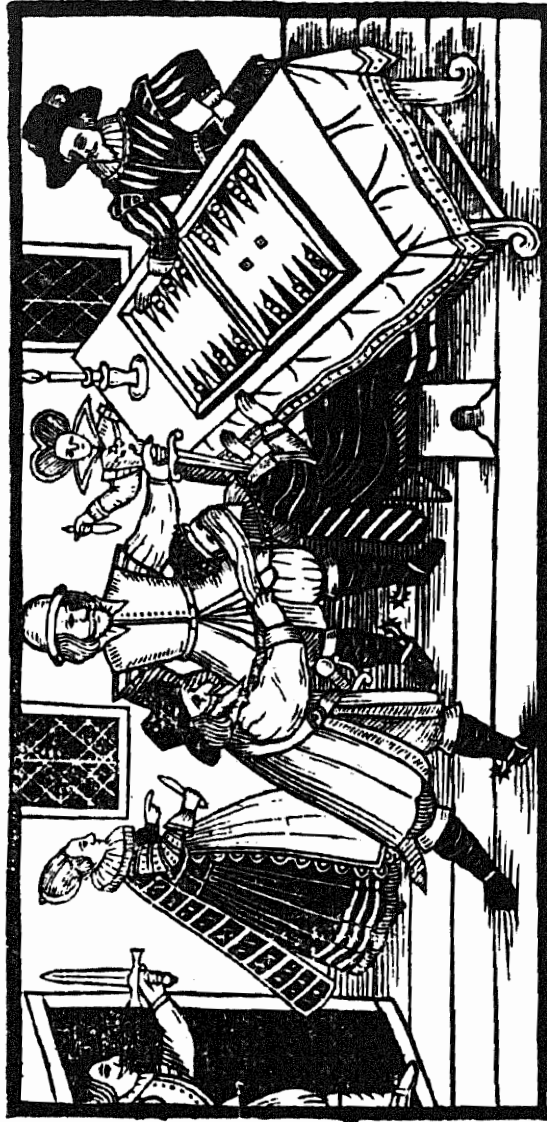
WOODCUT: SIG. A 1 V OF Q 3